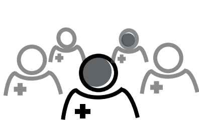
Shortages of maternity care providers

Since 2000, there have been at least twenty rural maternity care services that have closed in BC. These closures are occurring for various reasons, including: